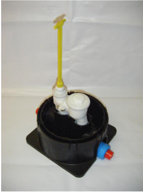
Side view of SENATE meter assembly without flow meter fitted