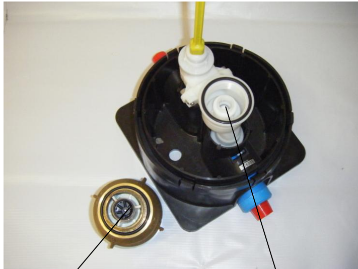
Central inlet port of meter unit 1 1/2" BSP