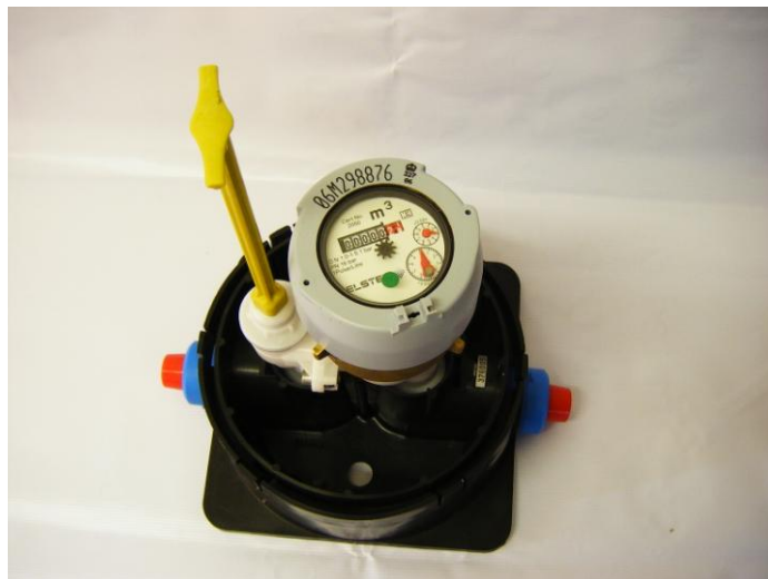
Top view of complete meter assembly